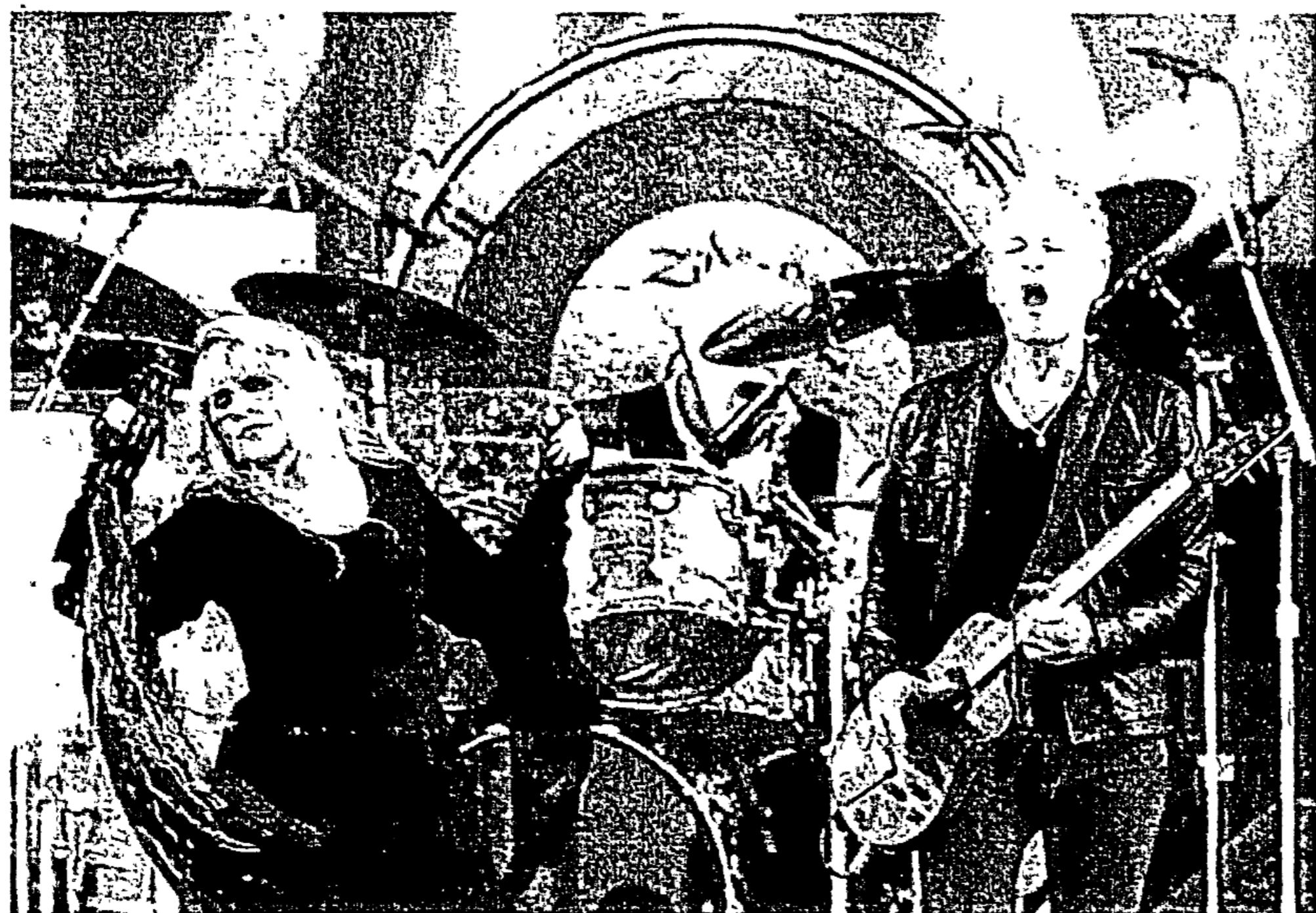
Fleetwood Mac's Stevie Nicks, Mick Fleetwood and Lindsey Buckingham

SCENES FROM THE FAIR GROUNDS, THE WEEK IN PICTURES, A-23 | REVIEWS OF HEADLINERS, A-15